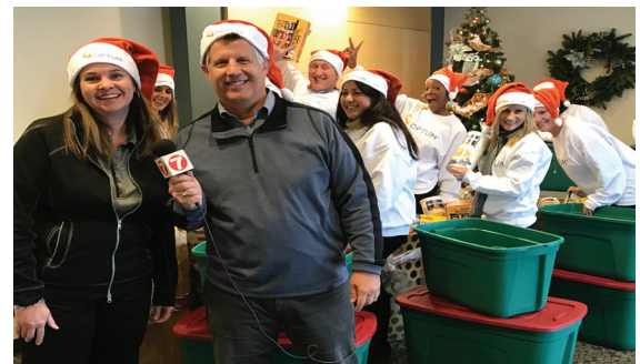
Live Broadcast at the Optum Office for 7Cares Idaho Shares