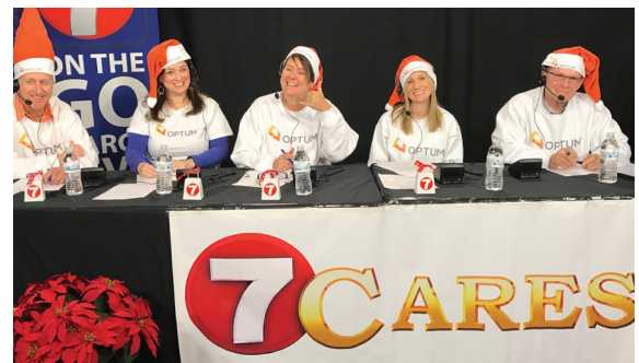
Optum Staff volunteering at the phone bank for 7Cares Idaho Shares